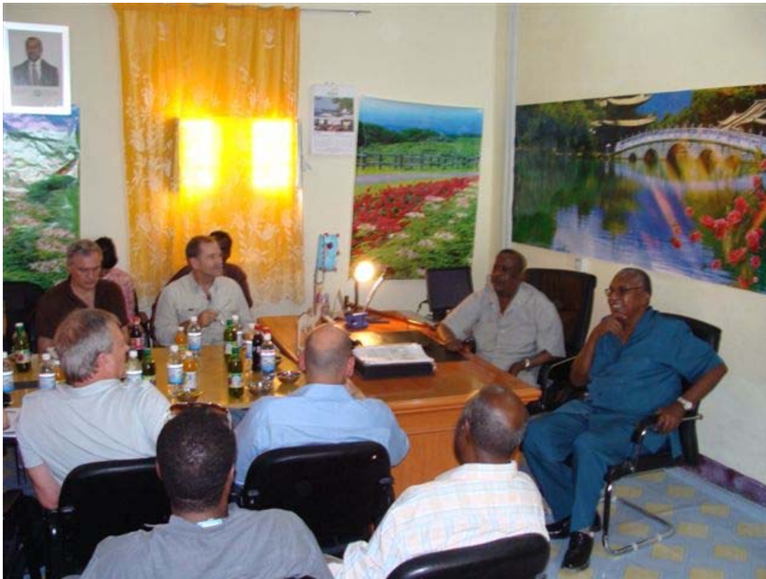
Meeting with Puntland Government

The Puntland Government has formally launched a new website www.puntlandgov.net in conjunction with two major initiatives undertaken by the Government. The launch was undertaken with Range and a number of foreign journalists and oil analysts who Range hosted in Puntland as part of the Company's push to increase exposure leading into the seismic and drilling programmes later this year. The Puntland Government also presented to Range and its guests the Puntland Five Year Development Plan which is a comprehensive document which sets out the Puntland Strategic Vision and the Policy Guidelines.