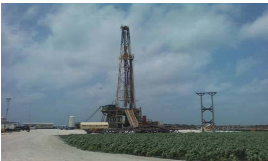
Figure 1: Precision #37 rig drilling ahead on Russell Bevly #1 Well

The Russell Bevly #1 confirms the Company's structural and stratigraphic models across the north western flank of the field, which formed the basis of the recently released reserve report (see Lonquist above). Once completed for production, the well is expected to add significant Proven Reserves, production, and cash flow to Range's Texas operations.