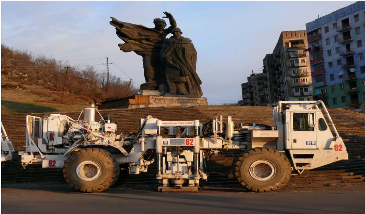
Figure 2 – Seismic Vehicle

The minimum requirements of Phase III of the PSA involves the drilling of one well in each licence block by April 2012.