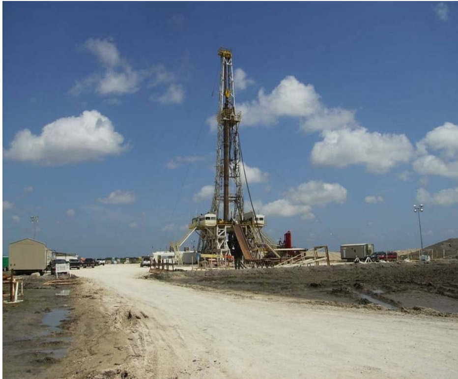
Figure 1: Unit Texas Rig #35 drilling ahead on Smith #1 well